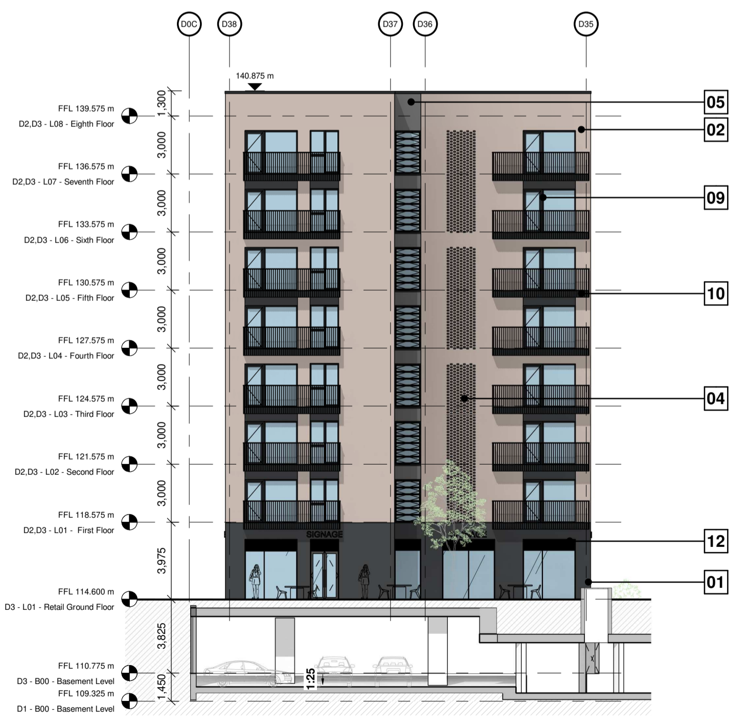
4 PROPOSED ELEVATION - BLOCK D3 - EAST 1 : 200

Notes: - Do not scale from this drawing. Use figured dimensions in all cases. - Verify dimensions on site and report any discrepancies to the Architect immediately. - This drawing is to be read in conjunction with the Architect's Specification. - © This drawing is copyright and may only be reproduced with the Architect's permission.