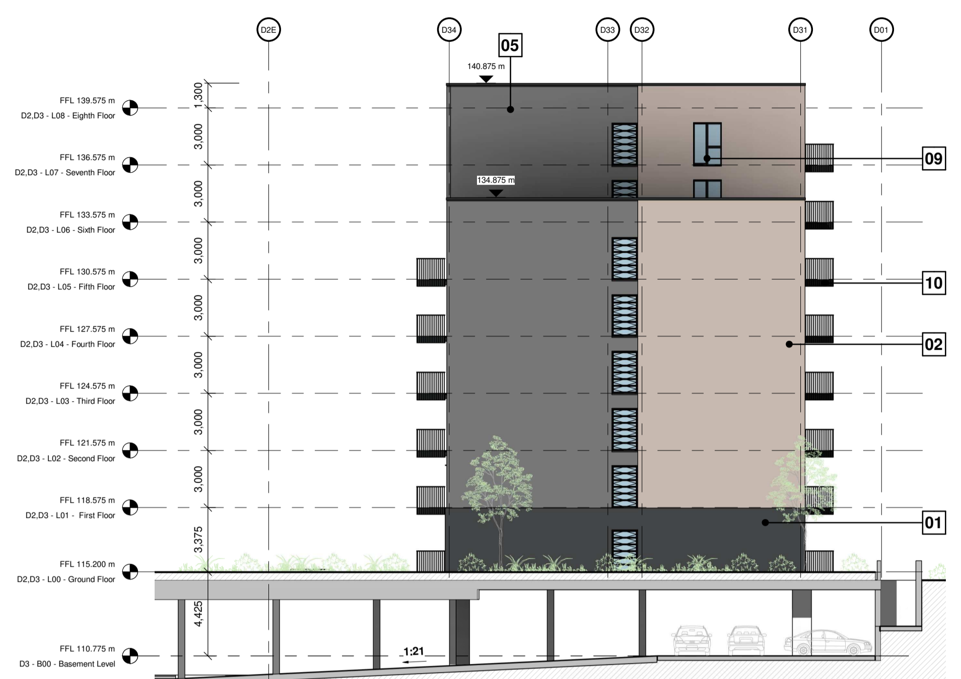
2 PROPOSED ELEVATION - BLOCK D3 - WEST 1 : 200