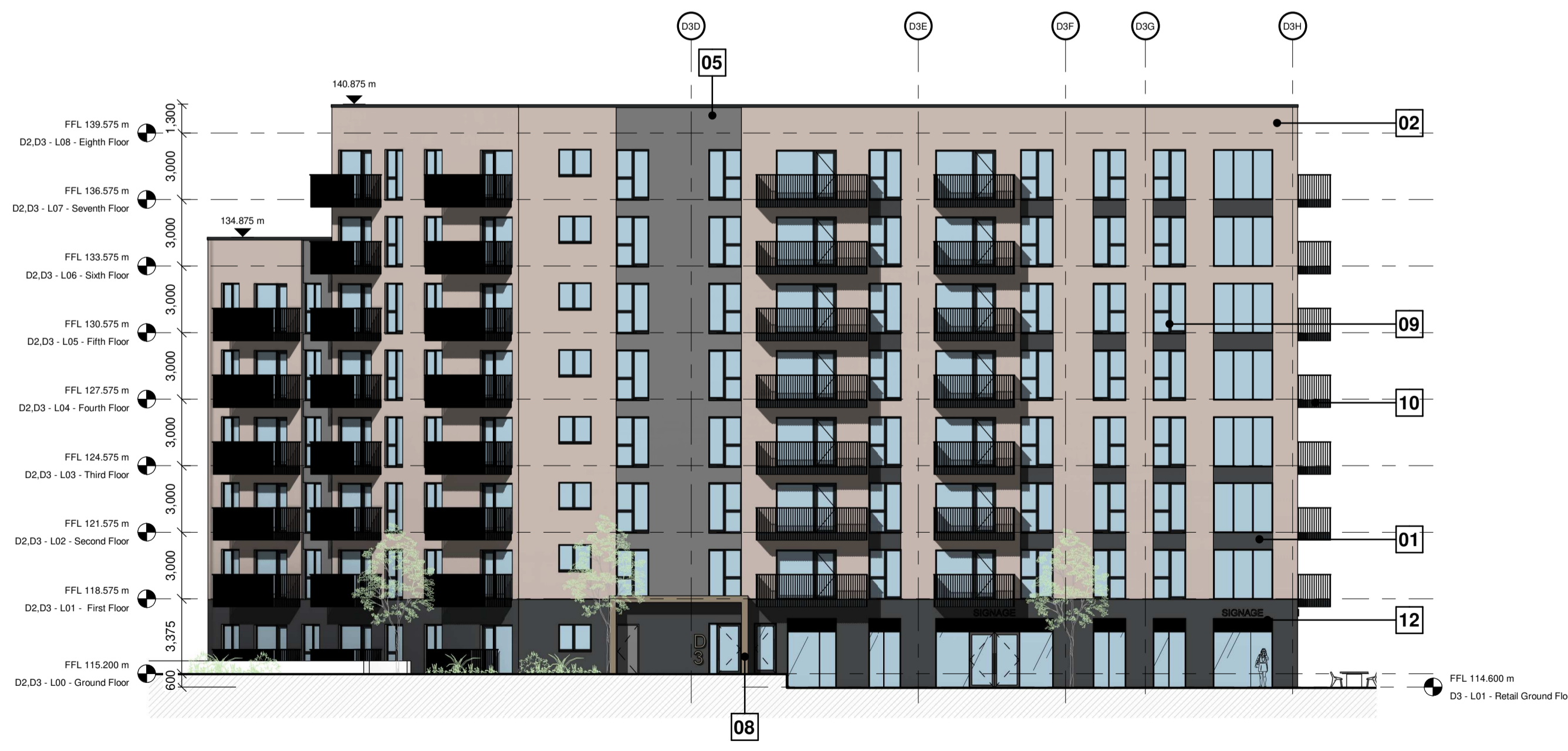
3 PROPOSED ELEVATION - BLOCK D3 - SOUTH 1 : 200