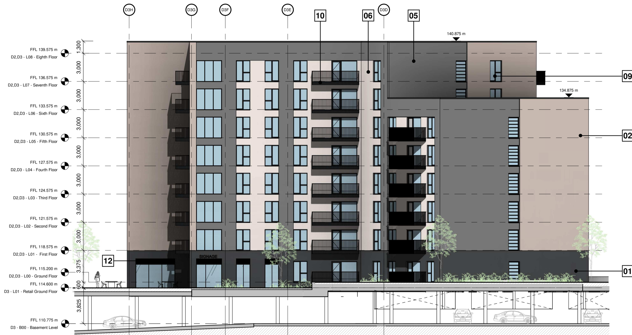
1 PROPOSED ELEVATION - BLOCK D3 - NORTH 1 : 200